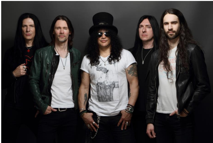
Slash Ft. Myles Kennedy & The Conspirators. Photo and logo download here.

GROUP ANNOUNCE U.S. HEADLINING TOUR TO KICK OFF THURSDAY, SEPTEMBER 13 IN LOS ANGELES ON SALE BEGINS FRIDAY, JUNE 22 AT 10AM EVERYWHERE ( www.ticketmaster.com )